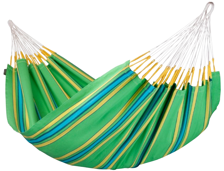
Double Hammock Currambera kiwi CUH16-4